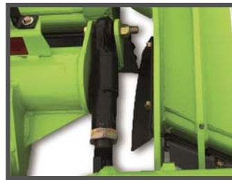
Heavy duty turnbuckles