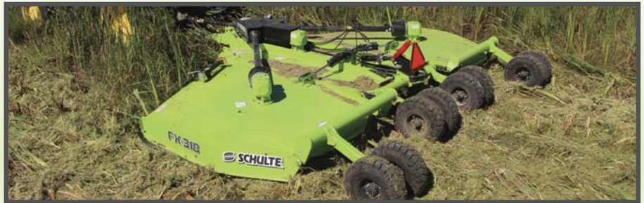
FX-318 mowing Cattails