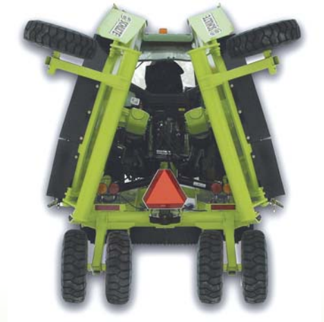
Ultra Narrow Transport Width