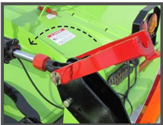
Single center lock up system