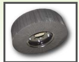
Solid Laminate Tires