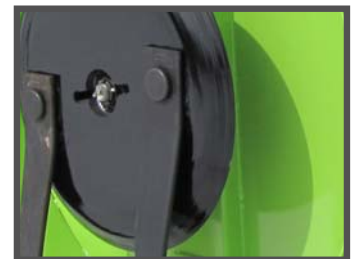
7 gauge spun formed stump jumper pans