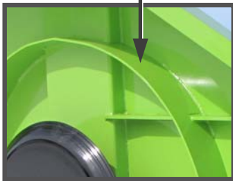
Deck protection rings are standard