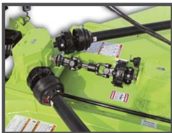
Heavy duty drive system for peak performance