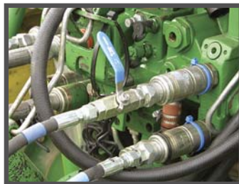
Ball valve wing lock up system