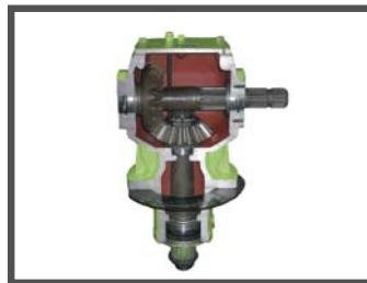
210hp right angle gearboxes heavy duty 1 3/4" input shafts. 2 3/8" ta- pered & splined down shafts