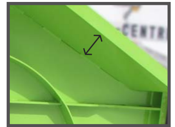
13 5/8" frame depth for maximum material flow