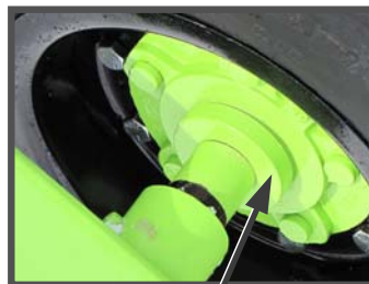
Metal seal guards on 517 hubs