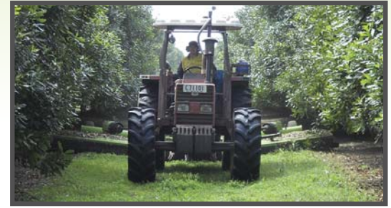
FX-318 mowing Macadamia Orchards