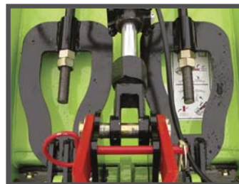
Dual levelling rods with floating hitch