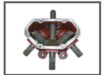
260hp heavy duty splitter box with 1 3/4" splined shafts